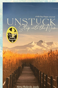
Unstuck: Step into the New